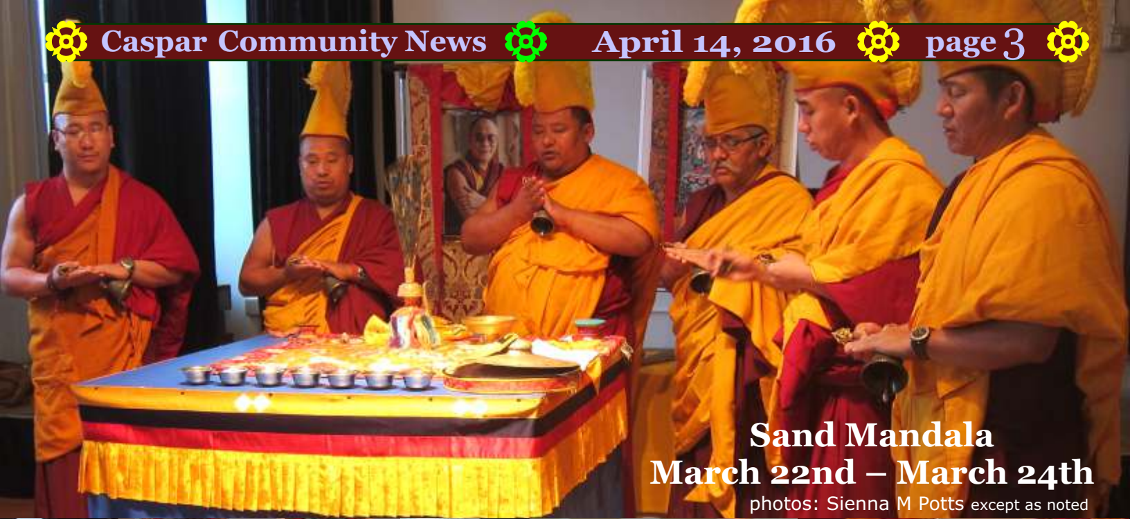
Sand Mandala March 22nd – March 24th photos: Sienna M Potts except as noted