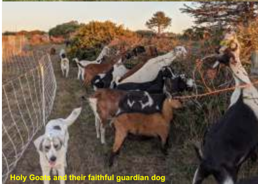
Holy Goats and their faithful guardian dog