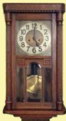
English Wall Clock circa 1900