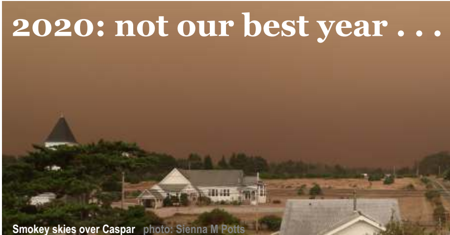
Smokey skies over Caspar

Of course the big bumper was no breakfasts or Pub Nights, and no event income. More about this on page 6