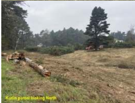
Katlin parcel looking North