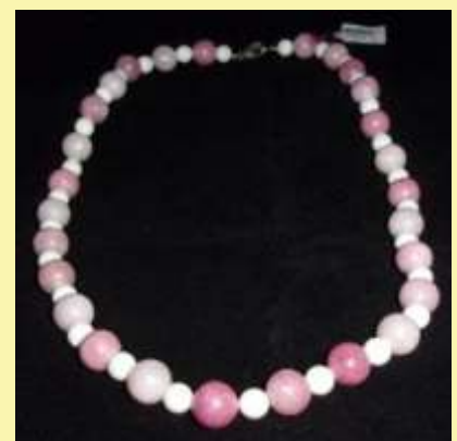
Rhoda Teplow's African Pink Opal Necklace